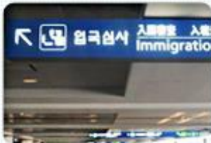
Proceed to the Immigration booth on 2 nd floor