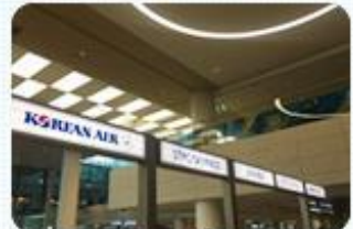
Receive information on hotel services