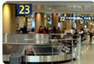
Pass through the baggage claim area on the 1 st floor